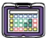
- a communication device